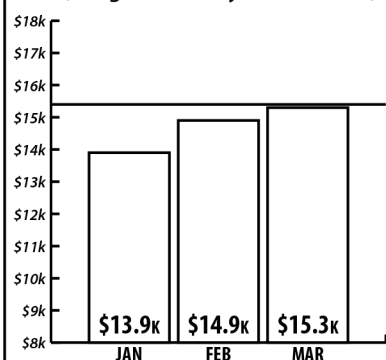
Average Weekly Giving Comparison (Budgeted Weekly Need = 15.4k)

One gives freely, yet grows all the richer; another withholds what he should give, and only suffers want. Proverbs 11:24